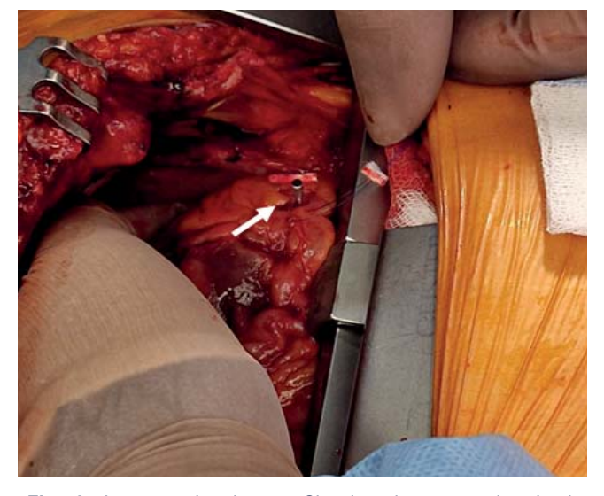
Fig. 2. Intraoperative image. Showing the pacemaker lead penetrated the right ventricular apex, reaching into the pericardium (white arrow)

BBL1672556) was implanted in the apical septum without any complication. One-day post-implantation, the chest X-ray showed the pacemaker lead in place