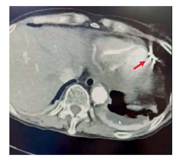
Fig. 1. Axial CT image of the heart showing pacemaker leads passing through the apex of the right ventricle (red arrow) and the tip of the pacemaker lead clearly seen outside (red arrow)

Upon admission, the patient was feeling sick, she was pale with blood pressure of 90/60 mm Hg and regular pulse rate of ~ 40 bm., respiratory rate of ~ 20/ min and absent breathing in the base of the left lung. An emergent echocardiography revealed a cardiac tamponade with a diffuse pericardial effusion leading to compression of the right atrium and right ventricle. Because of the threating condition of the patient an informed consent was signed and an immediate openheart surgery was undertaken.