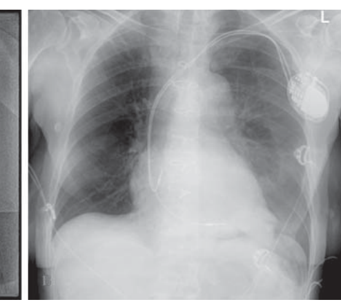
Fig. 5. Image 'A' at the end of the procedure showing the implantation side of the pacemaker body and leads. Image 'B' is the chest X-ray one-day post implantation showing the pacemaker lead in place