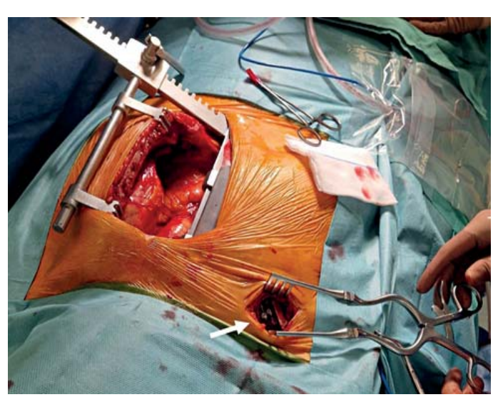
Fig. 3. Intraoperative image after cutting the tip of the electrode and opening the pacemaker pocket in order to transvenously remove the body and the lead

with the appropriate slack. The pacemaker parameters were satisfactory and the patient was discharged home on the same day (Figure 5).